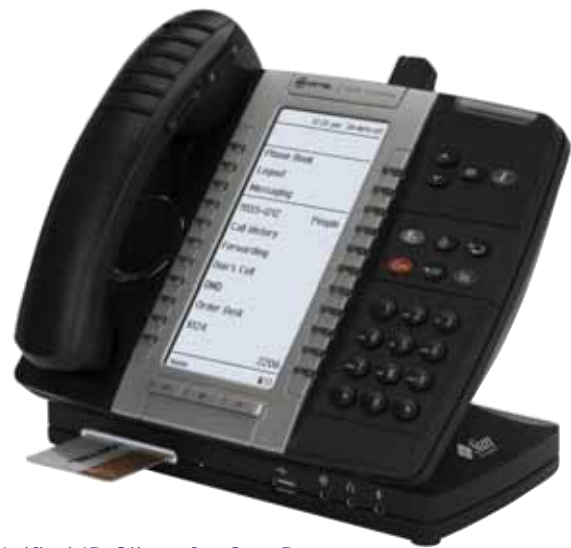
Mitel Unified IP Client for Sun Ray