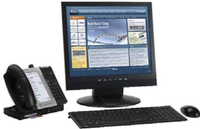
Mitel Unified IP Client for Sun Ray